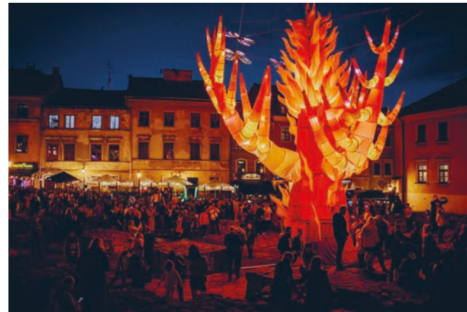
Night of Culture - an installation at the Po Farze Square in the Old Town in Lublin, referring to the city's founding myth – the dream of King Leszek the Black