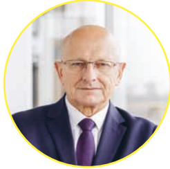
Krzysztof Żuk Mayor of Lublin