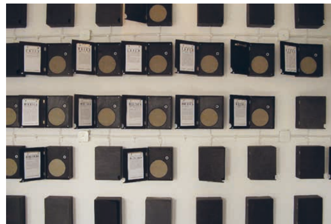
“Memory of the Place” exhibition

Translator, curator, educator at the “Grodzka Gate – NN Theatre” Centre in Lublin