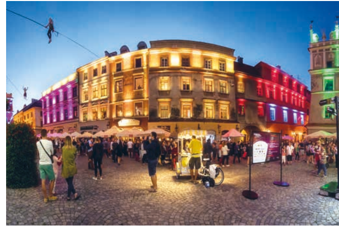
Magicians' Carnival / Urban High Festival, Old Town in Lublin

Final bid book: Cultural and artistic content European dimension