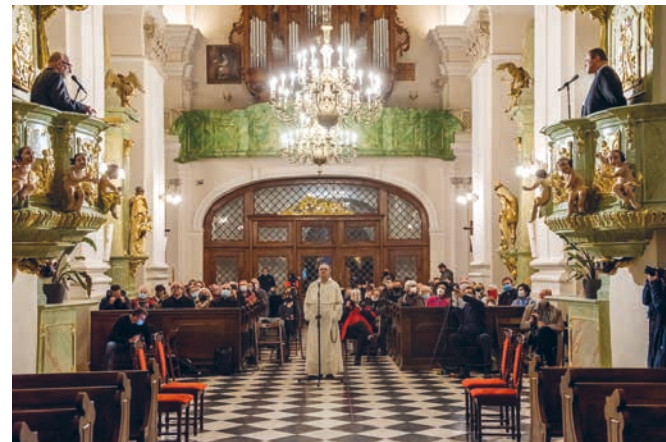
Debate between two pulpits in the Dominican Basilica, referring to the tradition of philosophical and theological debates held here