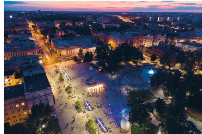
Litewski Square