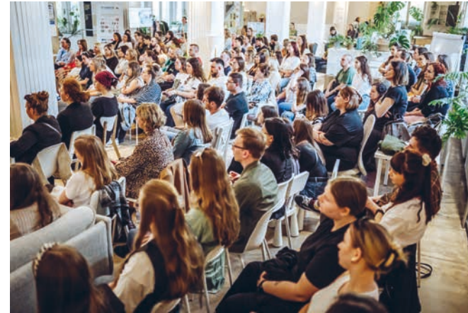
One of Baobab's workshop rooms

Baobab – place of meeting and integration opened in a high-profile bank building in the centre of Lublin; since 2023, operated by the Homo Faber Association in cooperation with the Municipality of Lublin and with financial assistance of among others UNHCR, Oxfam, Avaaz, Batory Foundation, IKEA Lublin.