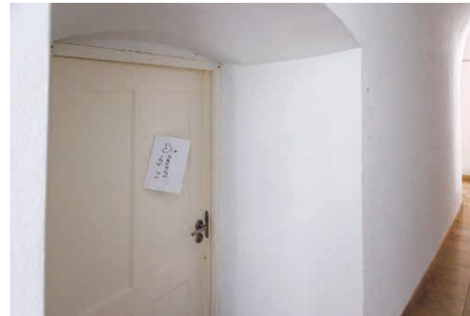
The Lublin Social Committee to Aid Ukraine was opened in the Centre for Culture on 24 February 2022, a few hours after the outbreak of the full-scale assault on Ukraine