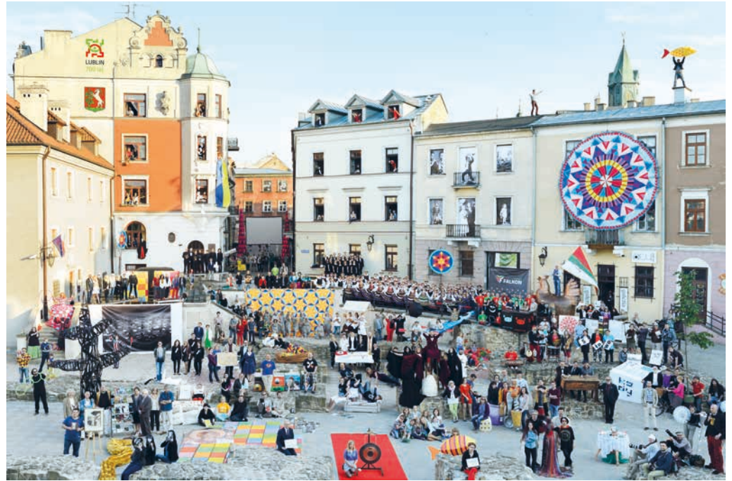
Group portrait photograph of the Lublin community of cultural creators, inspired by Pieter Bruegel the Elder's painting Netherlandish Proverbs